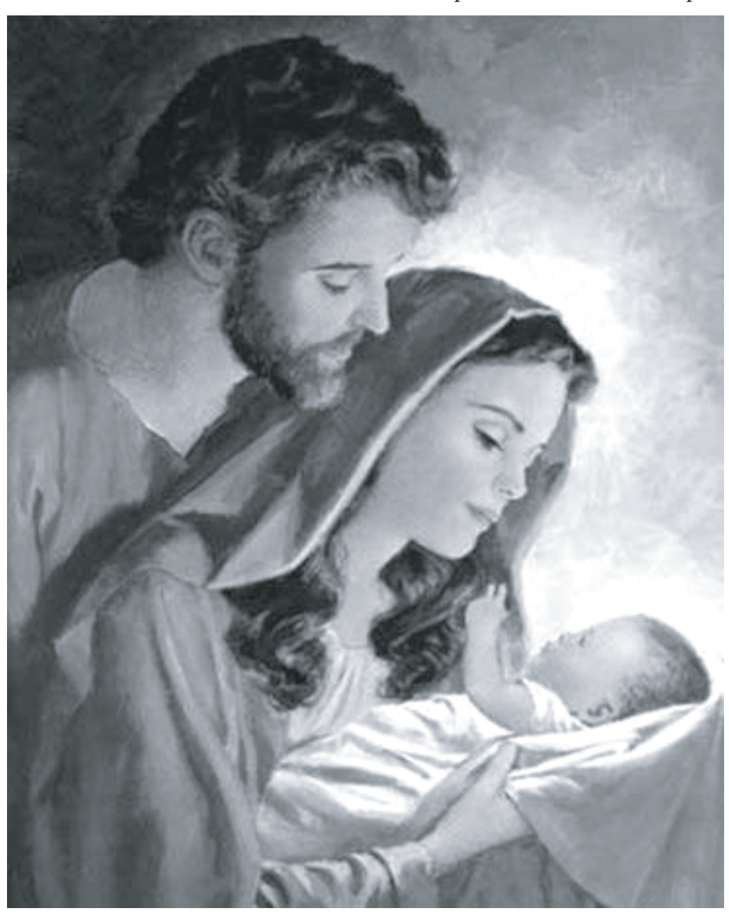
Feast of the Holy Family

Office Hours: Tues. & Wed. 9:30 am - 12:30 pm, Fri. 9:30 am - 12:30 pm